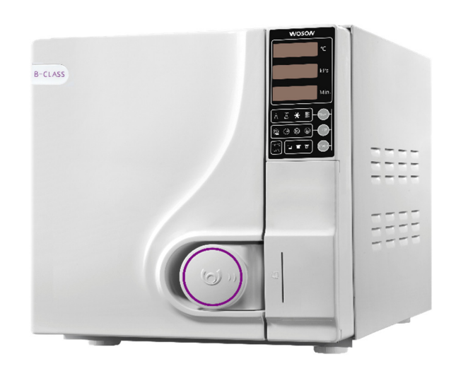
8 Litre B class Autoclave